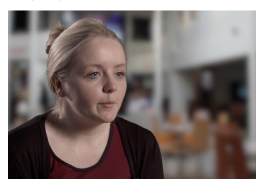
Figure 1. 'Advice to my first-year self' video

As indicated above, the first phase's research data reinforced the need to create an online module to support and improve BTEC students' transition into the HE teaching and learning environment. At Loughborough University, the project team brought in the support of a learning technologist and also called on the skills of the central virtual learning environment (VLE) team to create a module called WARM_UP (Welcome and Academic Resource Module for Undergraduate Preparation). During this stage, it was also decided to bring in former BTEC students who were now in their second year at Loughborough (including those who had taken part in the first phase of the project), to help assist the development of the module. This process also built upon the team's previous experience of creating video content to enhance the curriculum for a first-year study skills module delivered within the School of Business and Economics. 'Advice to my first-year self' (figure 1) was created in collaboration with second-year undergraduate students to help all undergraduate students to learn the skills necessary for successful transition to university, based upon personal experiences voiced by their peers.